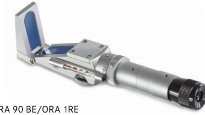
ORA 90 BE/ORA 1RE