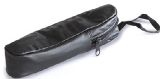
Leather bag ORA-A2103