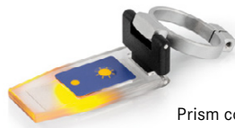
Prism coverplate with LED ORA-A1101